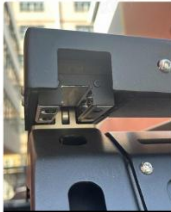
Easy to install