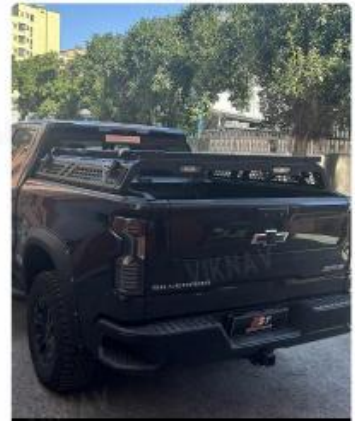
Sturdy and durable