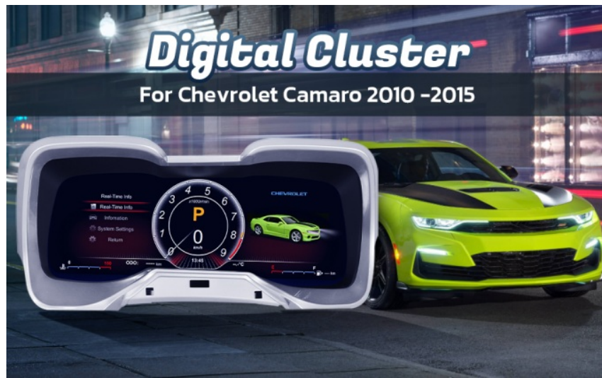
Traditional mechanical instrument replacement to high-definition LCD digital instrument display.