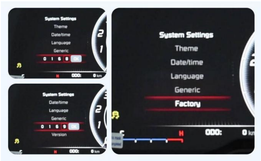
Three new interfaces